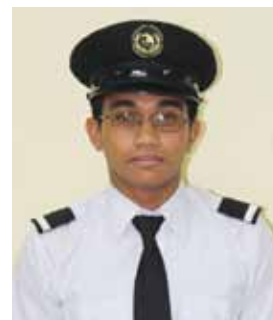
Pedro de Jesus Ximenes Belo